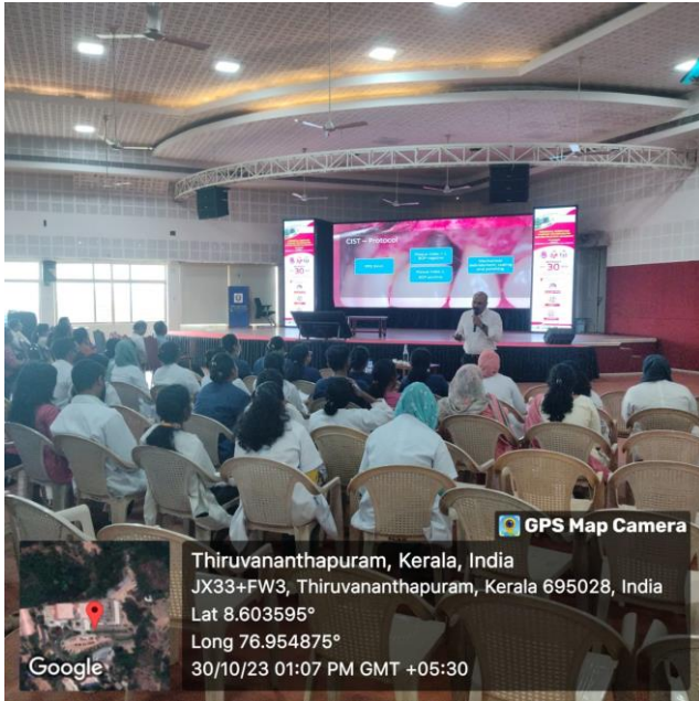
GPS Map Camera Thiruvananthapuram, Kerala, India JX33+FW3, Thiruvananthapuram, Kerala 695028, India Lat 8.603595° Long 76.954875° 30/10/23 01:07 PM GMT +05:30 Google