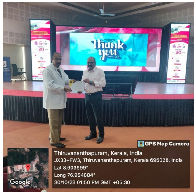
GPS Map Camera Thiruvananthapuram, Kerala, India JX33+FW3, Thiruvananthapuram, Kerala 695028, India Lat 8.603599° Long 76.954884° 30/10/23 01:50 PM GMT +05:30 Google