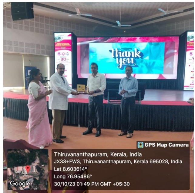
GPS Map Camera Thiruvananthapuram, Kerala, India JX33+FW3, Thiruvananthapuram, Kerala 695028, India Lat 8.603614° Long 76.95486° 30/10/23 01:49 PM GMT +05:30 Google